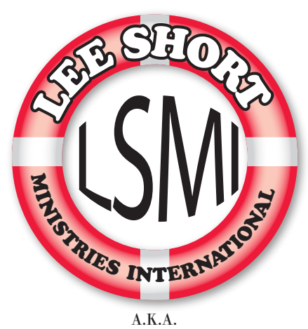
A.K.A. Vida Internacional